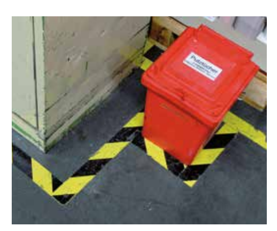
Everything has its own place – this creates an better overview and helps to prevent accidents.

Floors should be regularly checked for damages and where necessary must be repaired. Moreover, surfaces and floors must be suitable for the working task to be performed. If, for example, production processes include works with chemicals, the flooring/surface must be robust. It is not always necessary to change the entire flooring. Coating or chemical treatment of existing surfaces/finish can easily improve slip resistance.