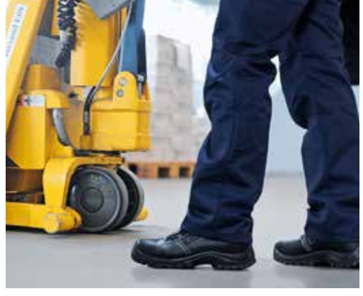
Use appropriate safety shoes for your work in order to prevent accidents.