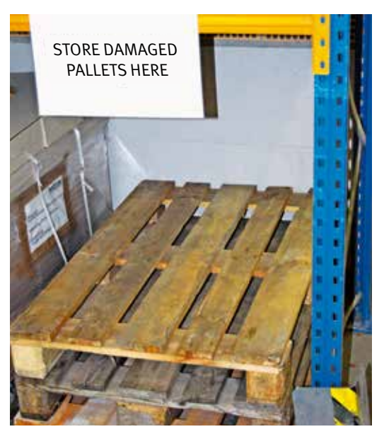
Store empty pallets in specified areas. Damaged pallets must be sorted out immediately!

Carelessness and disorder are often the cause of trips, slips and falls. New employees must be made aware of the correct procedures to use for their own and others' safety. (defined locations for the storage of empty pallets, location of waste containers, etc.)